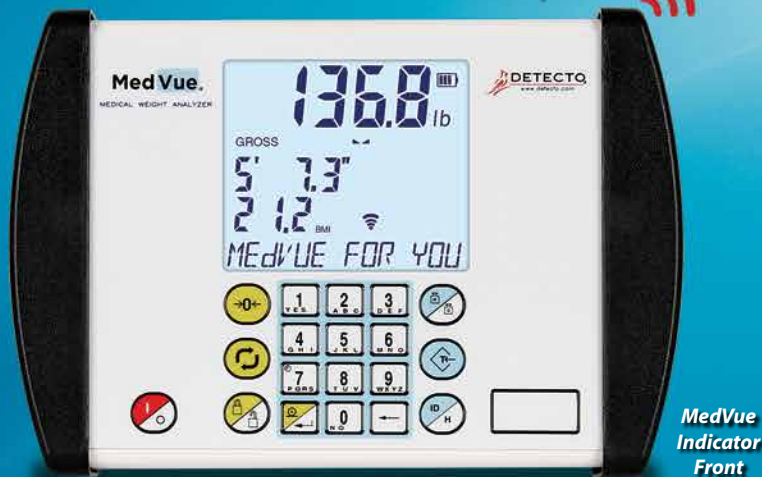
MedVue Indicator Front